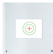
ZEISS VISUSCREEN 100/500 – advanced LCD acuity chart systems for fast, accurate monocular and binocular vision assessment