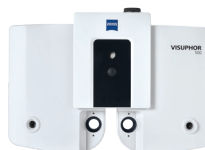
ZEISS VISUPHOR 500 – a digital phoropter that streamlines examination workflows and also contributes to the positive professional image of your eye care facility