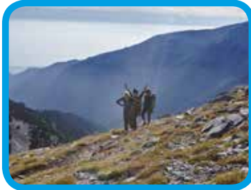
Mt. Olympus an hour's drive from meeting the Greek gods