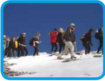
Seli an hour's drive to the closest ski resort