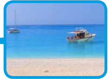
Chalkidiki a 40 min drive to some of the best beaches in Greece