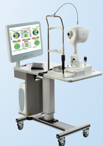
iVue SD-OCT includes a full suite of retina, optic nerve and cornea scans.

Optovue, Incorporated: 2800 Bayview Drive, Fremont, CA 94538 PH: +1 510.623.8868 | FX: +1 510.623.8668