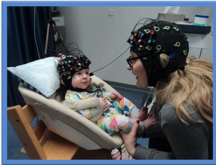
Figure 1. An exemplary mother-infant dyad during the free play interaction condition.