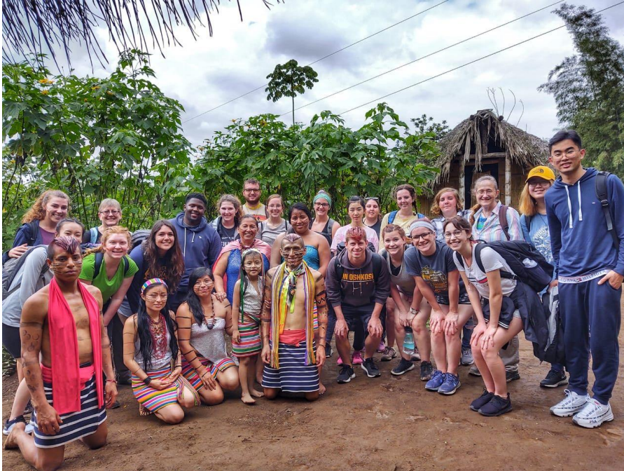
UW Oshkosh - Ecuador 2020