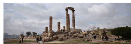
CET Jordan: Virtual Intensive Language and Culture