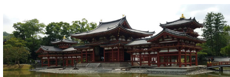
CET Japan: Virtual Intensive Language and Culture