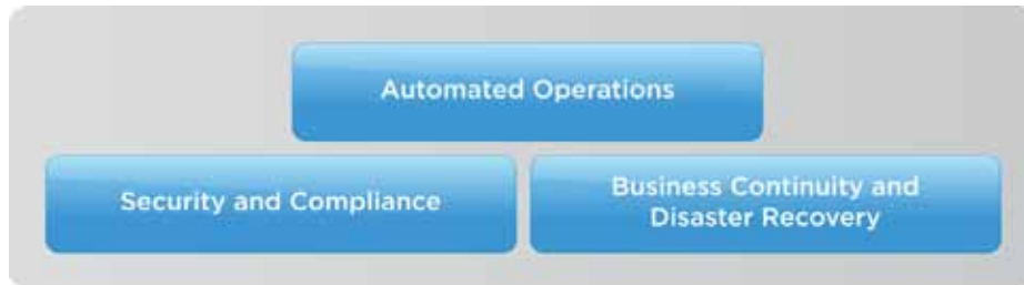
Figure 2: VMware virtualization and cloud management provide a new approach to managing IT in the cloud era.

and applications from the datacenter to the virtual machine level provides you with a single source of truth.