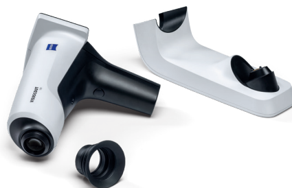
The ZEISS VISUSCOUT 100: flexible and mobile fundus imaging

VST.6572 Rev C Printed in the United States. CZ-V/2018 United States Edition: Only for sale in selected countries. The contents of the brochure may differ from the current status of approval of the product or service offering in your country. Please contact our regional representatives for more information. Subject to change in design and scope of delivery and as a result of ongoing technical development. VISUSCOUT and FORUM are either trademarks or registered trademarks of Carl Zeiss Meditec AG or other companies of the ZEISS Group in Germany and/or other countries. © Carl Zeiss Meditec, Inc., 2018. All rights reserved.