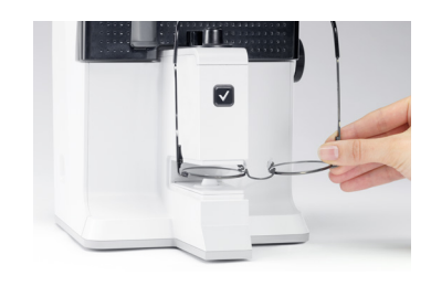
Measurement of UV transmission.