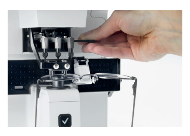
Easy to refill marking system with three marking pens.