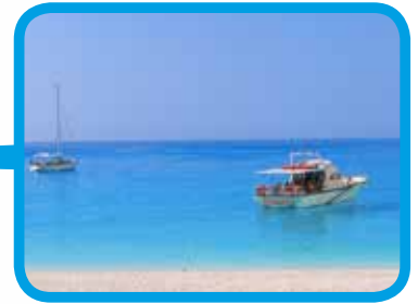
Chalkidiki a 40 min drive to some of the best beaches in Greece