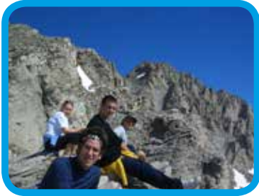
Mt. Olympus an hour's drive from meeting the Greek gods