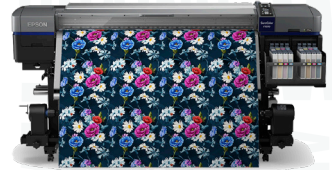
Epson SureColor F9370