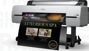
Epson SureColor P10000