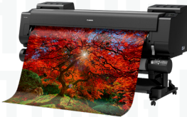
Canon iPF PRO-6000