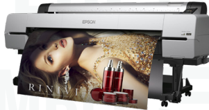
Epson SureColor P20000