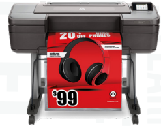
HP DesignJet Z6