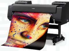
Canon iPF PRO-4000