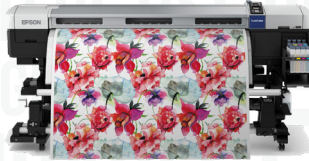
Epson SureColor F7200