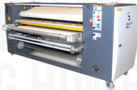
Practix OK-10 66" Sublimation Transfer Press