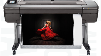
HP DesignJet Z9+