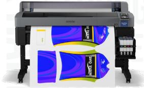
Epson SureColor F6370