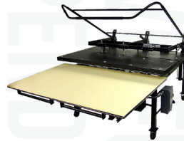
Geo Knight Maxi Press Large Format Heat Press