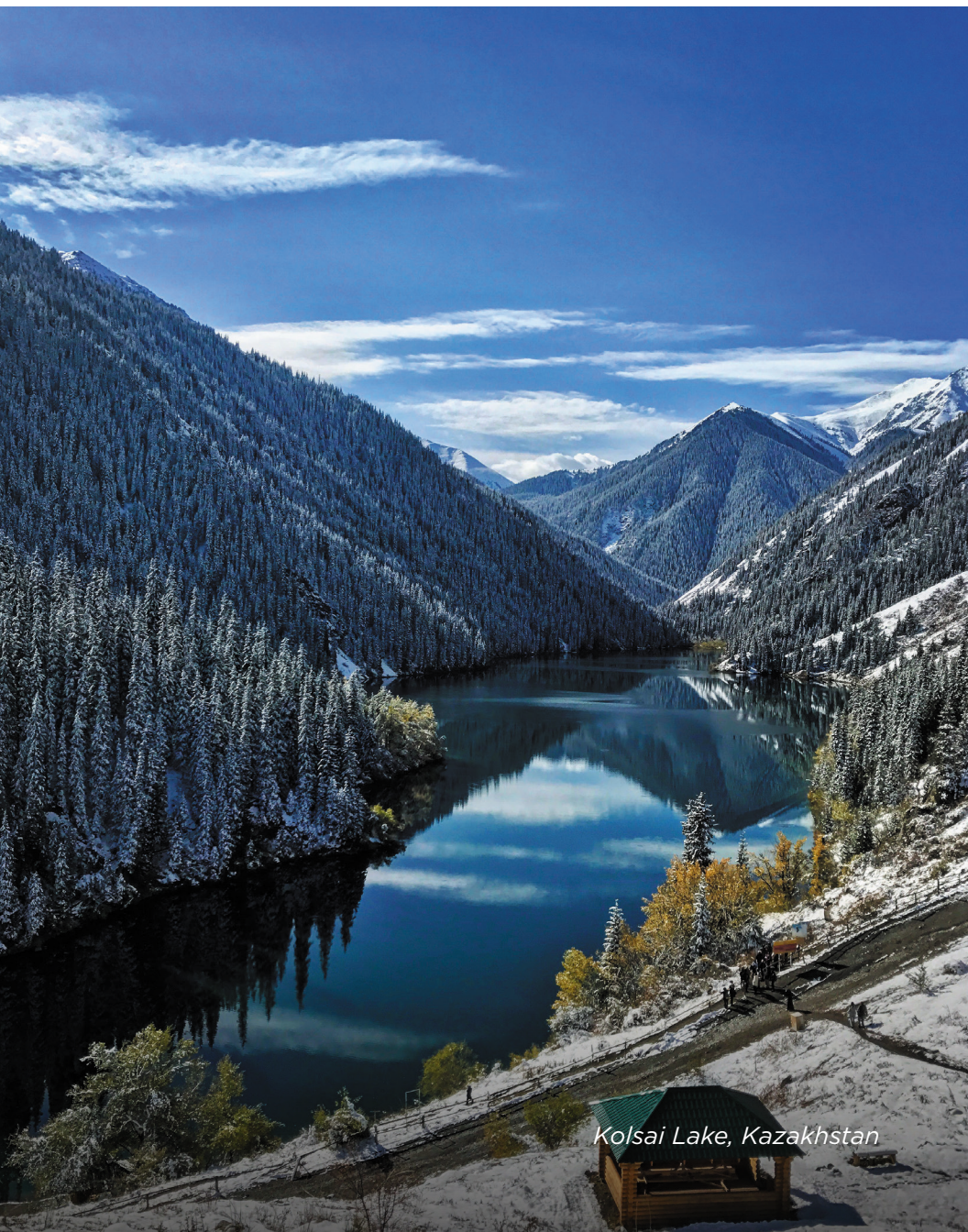
Kolsai Lake, Kazakhstan