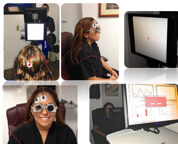
Figure 1. Clinical setup of the Diopsys SD-tVEP testing system. ERG studies can be performed using the same apparatus with adhesive lower-lid skin electrodes.

The proportion of eyes designated as suspicious or abnormal by the Diopsys Nova-LX scoring algorithm was determined for patients with differing perimetric disease severity based on their latest HFA 30-2 visual field (mild, mean deviation (MD) > -6 dB; moderate, -6 to -12 dB; severe, MD < -12 dB). We compared latency failure with HFA Guided Progression Analysis acquired over the preceding 4 to 7 years to determine whether a single VEP test might help to identify eyes at increased risk of