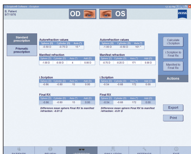
Figure 2. The i.Scription software user interface entry screen.

Subjects were required to fill out a daily study journal commenting on their visual experiences under specific visual conditions that were outlined in the journal.