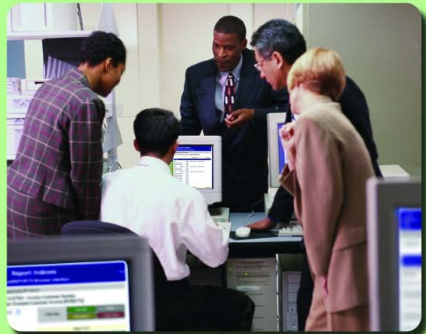
Robot/REPORTS lets you see critical report information quickly.

Report processing and output that uses different symbols or currency is no problem. If your finance database lists amounts in British pounds, Robot/REPORTS can output your finance reports in pounds. If your parts file contains special characters, Robot/REPORTS produces your inventory report using those special characters.