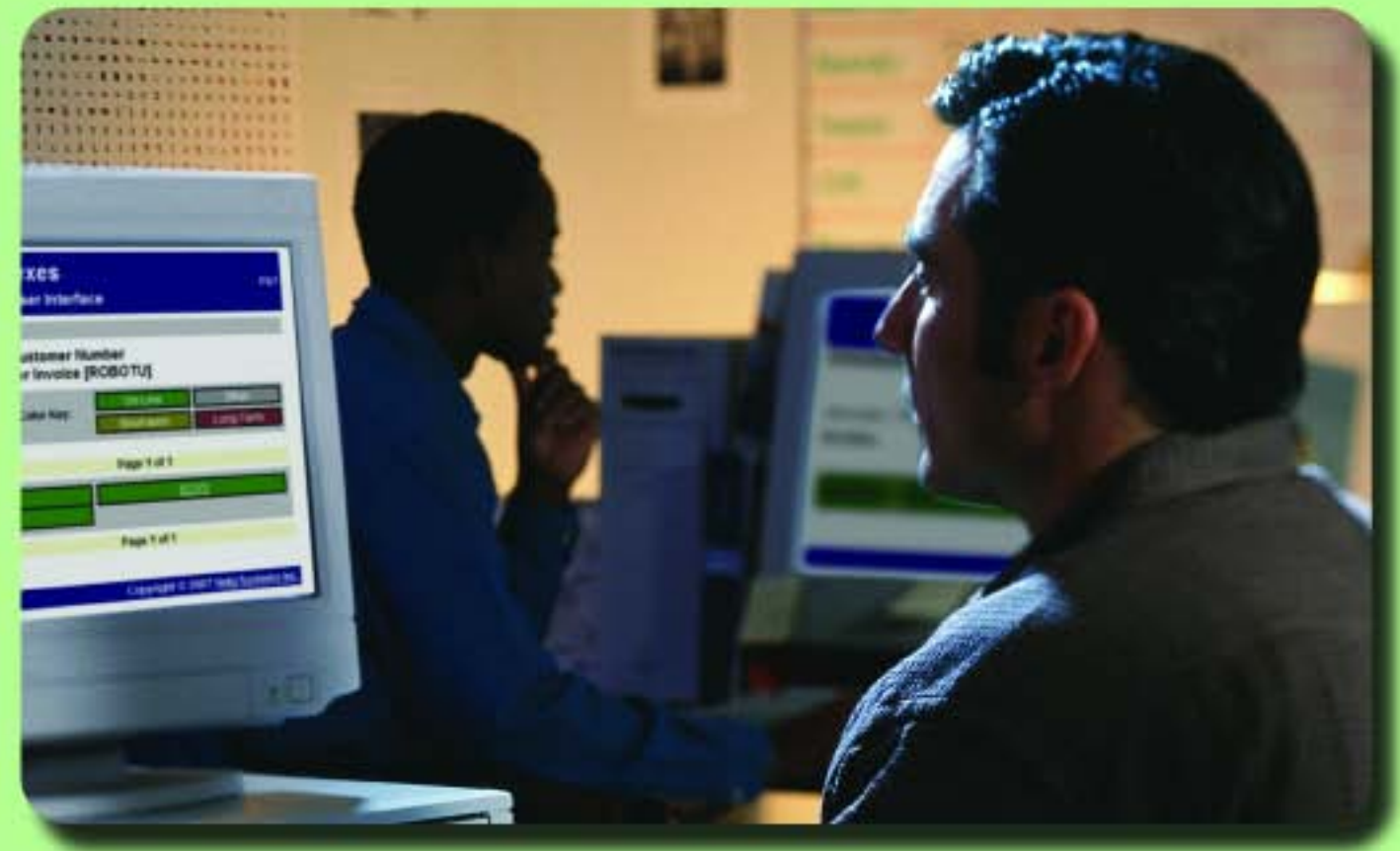
You can easily view or print reports from online, short-term, or long-term storage.