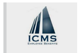
Innovative Cost Management Systems, Inc.