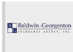
Baldwin-Georgetown Insurance Agency, Inc.