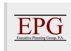
Executive Planning Group