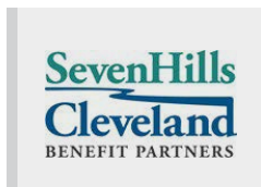
SevenHills Cleveland Benefit Partners, Inc.