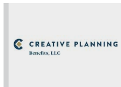
Creative Planning Benefits, LLC