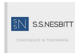
S.S. Nesbitt & Company