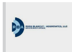
Russ Blakely & Associates