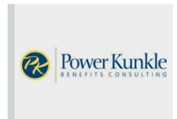
Power Kunkle Group, Inc.