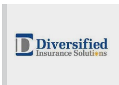
Diversified Insurance Solutions