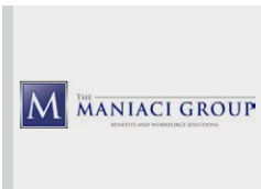
Maniaci Insurance Services, Inc.