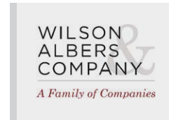
Wilson Albers & Company