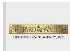
Shepard & Walton Life