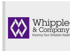
Whipple & Company