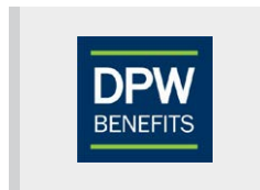
Davis Pacific Benefits