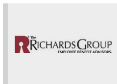
The Richards Group