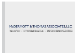
McDermott & Thomas Associates