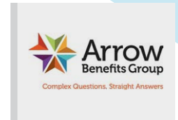
Arrow Benefits Group