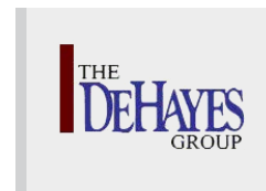
The DeHayes Group