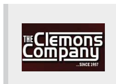
The Clemons Company