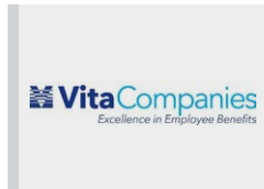
Vita Benefits Group