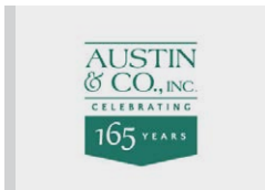
Austin & Co., Inc.