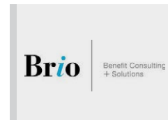
Brio Benefit Consulting