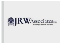
JRW Associates Inc.