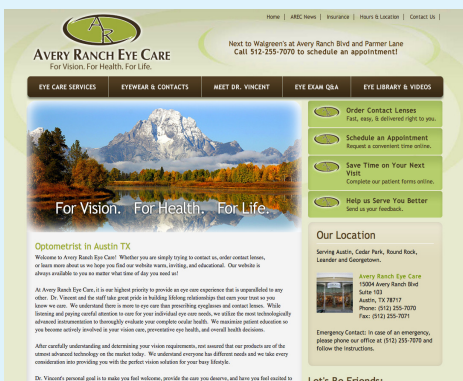
eg. Avery Ranch Eye Care Site

Take advantage of our top-notch customer support for help when you need it.