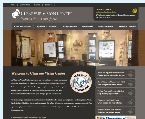
eg. Clearvue Vision Center Site