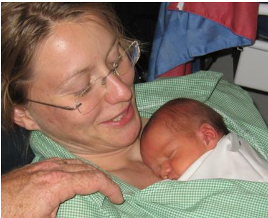
KANGACARRIER FOR SAFE SKIN TO SKIN CONTACT

Order at: www.ninobirth.org https://www.facebook.com/ninobirth