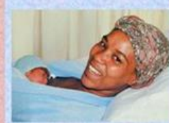
Restoring the Original Paradigm for Infant Care and Breastfeeding