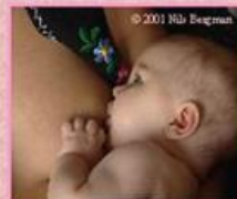
Rediscover the Natural Way to Care for Your Newborn Baby