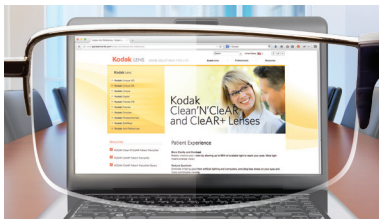
Regular Lens KODAK Clean'N'Clear Lens

KODAK Clean'N'Clear Lenses provide eyecare professionals with a recognizable customer brand known for trust, respect and loyalty to offer patients.