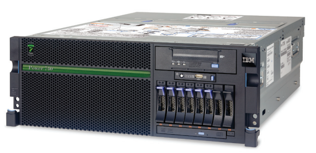
IBM Power 740 Express (rack-mount)