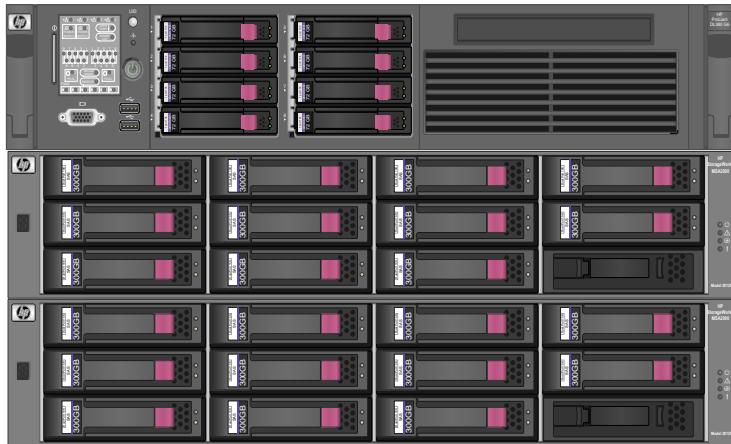
Figure 1. Fast Track 4TB reference architecture with the ProLiant DL380 G6 and (2) StorageWorks MSA2312fc

A complete SQL Server DBMS (Database Management System) configuration, or “stack,” is a collection of all the components that are configured to work together to support the database application. This includes the physical server hardware (with its BIOS settings and appropriate firmware releases), memory, CPU (number, type, clock and bus speed, cache and core count), operating system settings, the storage arrays and interconnects, disk (capacity, form factor and spindle speeds), database, DBMS settings and configuration, and even table types, indexing strategy, and physical data layout.