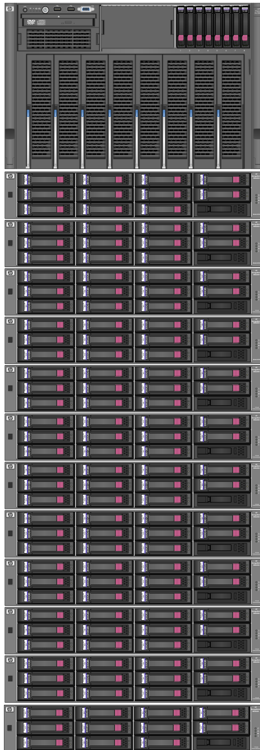
Figure 1. Fast Track 24TB reference architecture with the ProLiant DL785 G6 and (12) StorageWorks MSA2312fc

A complete SQL Server DBMS (Database Management System) configuration, or “stack,” is a collection of all the components that are configured to work together to support the database