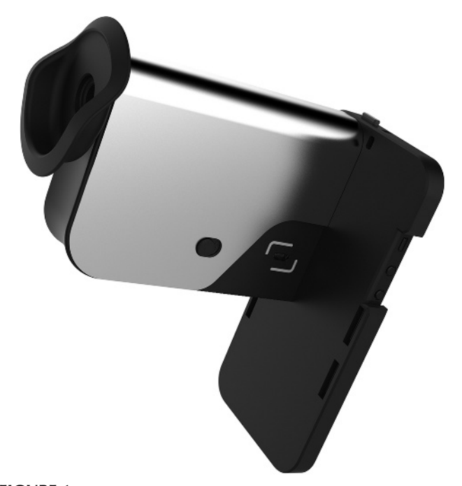
FIGURE 1. The SVOne aberrometer/autorefractor.

findings of the SVOne with retinoscopy, subjective refraction, and two other commercially available autorefractors, namely, the Topcon KR-1W wavefront analyzer (Topcon Corp, Tokyo, Japan) and the Righton Retinomax-3 handheld autorefractor (Righton Ophthalmic Instruments, Tokyo, Japan). Assessment of refractive error was undertaken both before and after instillation of a cycloplegic agent.