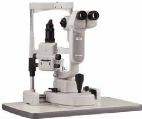
SL-D2 Slit Lamp