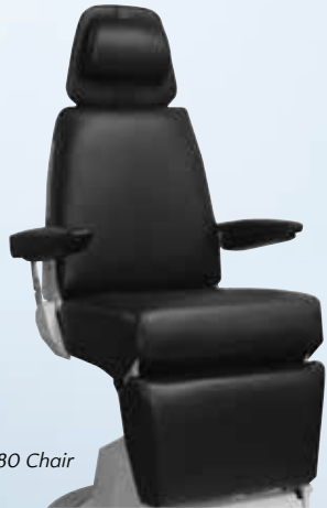
Reliance 980 Chair

All refurbished equipment comes complete with our industry leading warranty and lifetime phone support, offering pre-owned with a peace of mind.