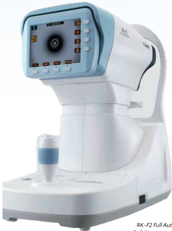
RK-F2 Full Auto Ref-Keratometer