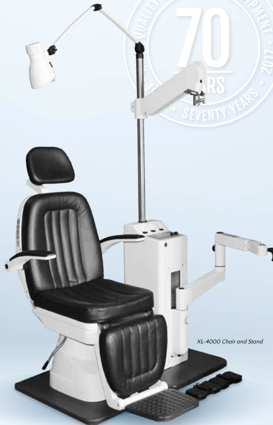
XL-4000 Chair and Stand