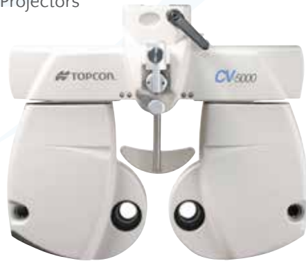
CV-5000s Automated Vision Tester