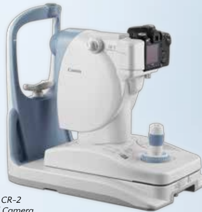
Canon CR-2 Retinal Camera