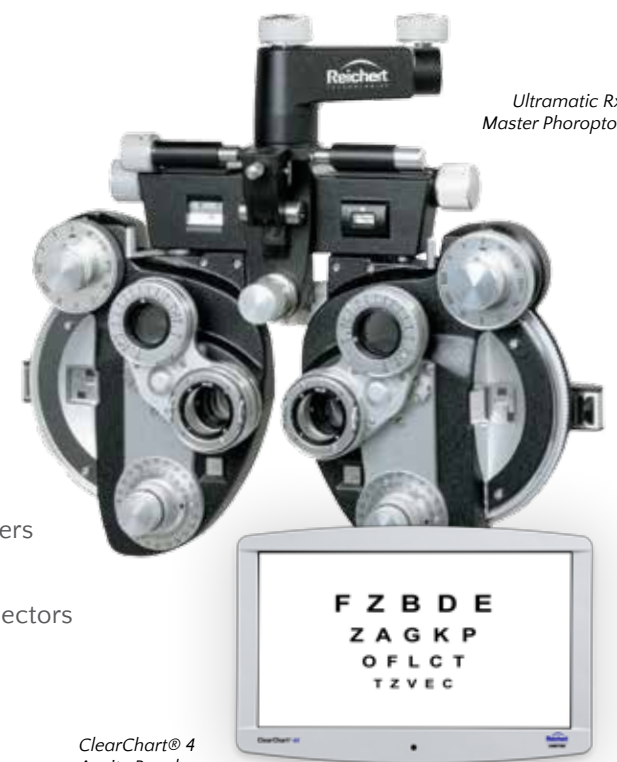
Ultramatic Rx Master Phoroptor