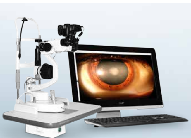
SL-3MZD Digital Slit Lamp

To back our commitment to quality, all Burton equipment comes with our industry leading 3 year warranty .