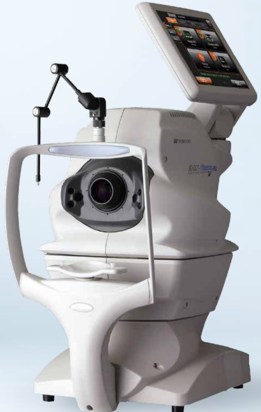
3D OCT-1 Maestro