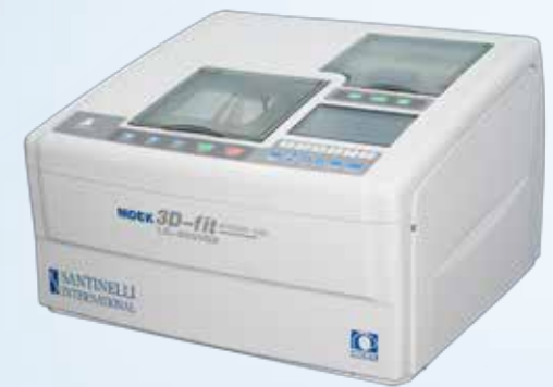
Nidek 3D-fit Patterless Edger