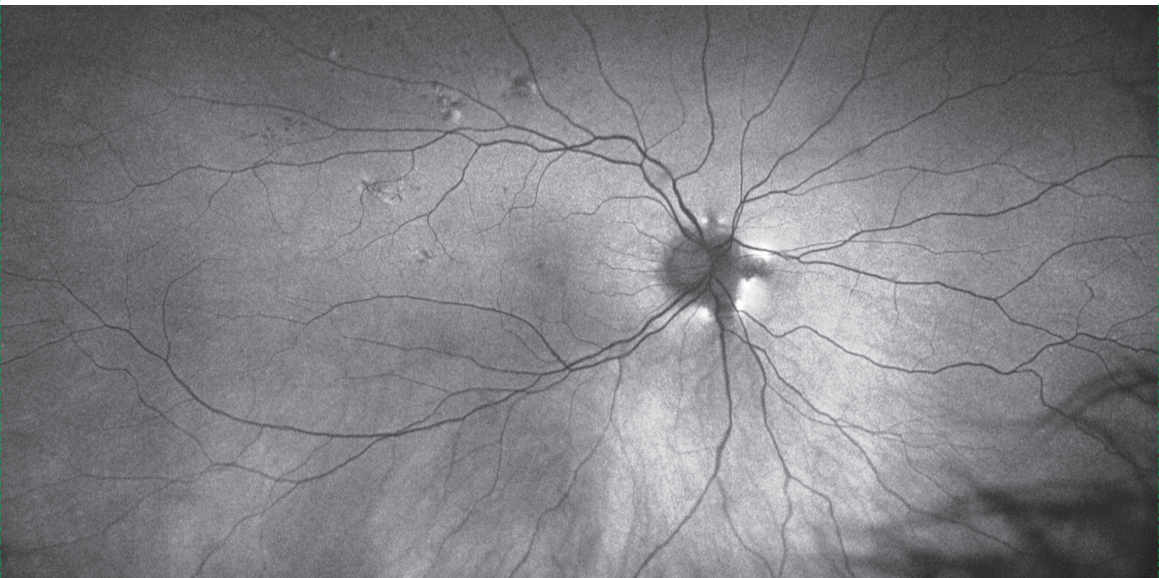
Daytona optomap af