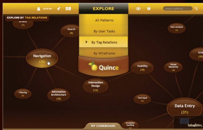
Figure 1 - Users of the Quince UX patterns browser have many ways to find the UX design patterns they need for their next implementation, including searching by the tags of related patterns (i.e., patterns tagged "Navigation").

Based on the overwhelming demand of UI designers, interactive designers and UX professionals everywhere, Infragistics is now rolling out Quince Pro™ and offering you a 30-day free trial to this new service.