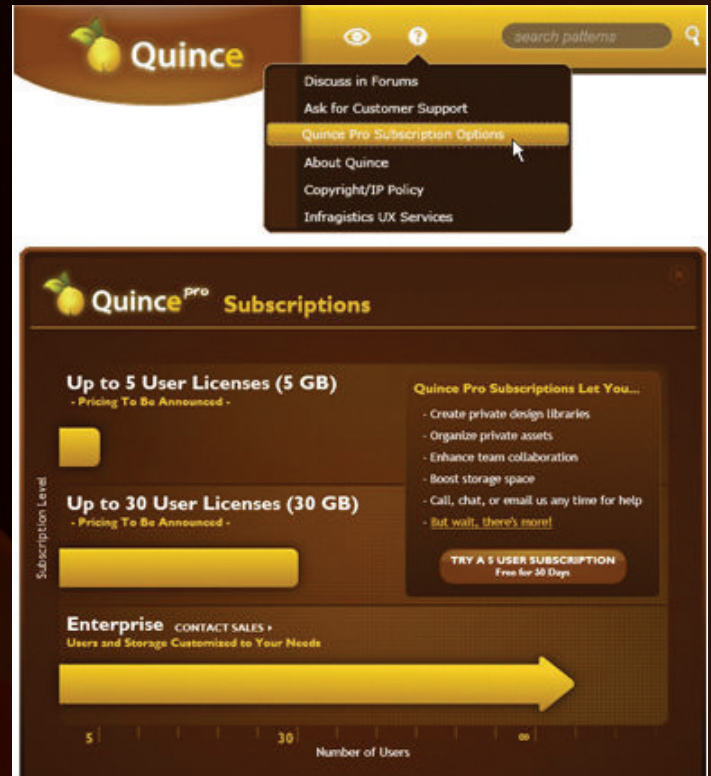
Figure 6 – It’s easy to start a 30-day free trial of Quince Pro that you can evaluate with up to 5 separate users on your team and 5 GB in total storage.

This isn’t possible when you must spend all of your time administering staff, servers and budgets instead of the UX design guidance that you’re passionate about.