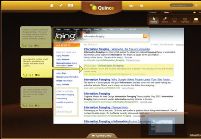
Figure 5 – Quince Pro lets you markup examples with its palette of drawing tools for creating callouts, highlights, sticky notes and more, each a potential starting point for further design conversations.

Attachments of URLs and files let you bring any collateral you may have into your Quince Pro design libraries. If you are designing a Web site then perhaps CSS stylesheets are needed, in Quince Pro you can attach them. If you are migrating your style guide for a brand overhaul into Quince Pro and have legacy artwork, you can attach that, too. Want to keep certain resources on-premises, but refer to them from Quince Pro, then you can even link to them with URLs onto your site.