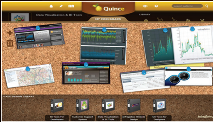
Figure 3 - Quince Pro users have multiple, private libraries (appearing as customizable binders), and use the “My Corkboard” feature to prepare, organize or share examples between libraries.

If you are working for a Big 3 automaker, Big 4 accountancy, or another company in a highly competitive industry though: How likely are you to share the proprietary designs and UX patterns specific to your industry that give your company a competitive edge with the designers from rival companies? Not likely going to happen!