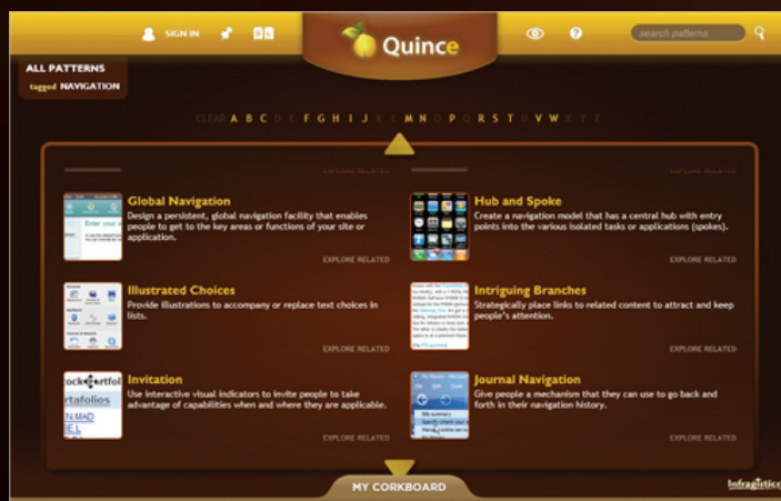
Figure 2 - Users of the free community-driven Quince UX patterns browser exploring the many patterns submitted that have been tagged "Navigation."

a particular design pattern, they can post a comment on that pattern or the examples of that pattern, and get feedback on how a pattern can be applied or improved from other community members.