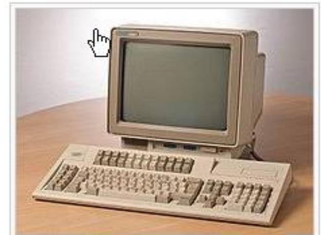
IBM 3486 Terminal, a later terminal with 5250 functionality, capable of supporting two independent sessions concurrently, and with an amber screen. The original 5251-1 had a much smaller keyboard. [1]