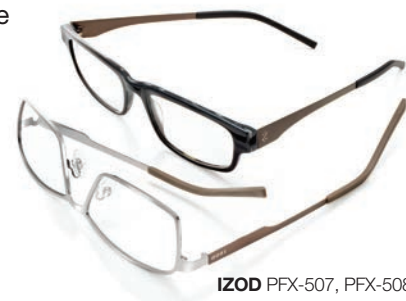
IZOD PFX-507, PFX-508

The iconic IZOD eyewear brand provides a style for every profile, for men ages 25-50. IZOD Boys delivers sporty styles for boys ages 7-14. XLFit™ selections available.