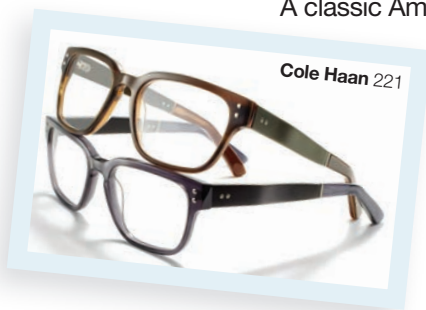
Cole Haan 221

A classic American brand delivering fresh, modern style for the young in spirit. For men and women ages 25 -55. Men's XLFit™ selections available.