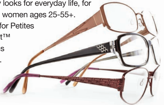
ClearVision Tina, Leigh, Megan

Classic and contemporary styles delivering everyday looks for everyday life, for men and women ages 25-55+. Passion for Petites and XLFit™ selections available.