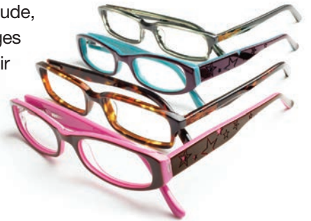
Digit Thermal, Magnetic

Hip, trendy, “grown up” looks with a fun attitude, for kids & tweens ages 6-12 who define their own individual sense of style.