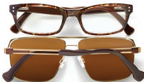
Marc Ecko Cut & Sew Monitor, Mile High

A new American sensibility that re-imagines cult classics, Marc Ecko Cut & Sew eyewear is an expression of artistic creativity for men ages 20-40 who know that authenticity counts. XLFit™ selections available.