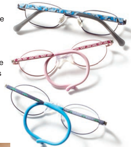
Dilli Dalli Munchkin, HotShot

Created to meet the needs of both parents and their little ones, the Dilli Dalli pediatric eyewear collection offers unsurpassed durability, a comfortable fit, and adorable style for infants and toddlers 3 months to 3 years. Features the innovative IntelliFlex™ multi- action spring hinge.