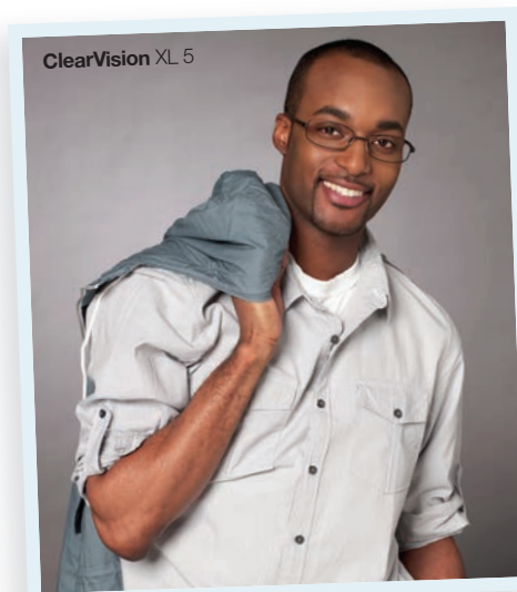
ClearVision XL 5

Style and durability in a perfect fit, for men whose facial features require a larger frame.