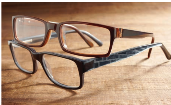
Junction City Fairmount, Forest Park

Inspired by cultural nuances of life in the city, the Junction City collection is all about today's fashionable styles at just the right price, for men and women ages 24-40.