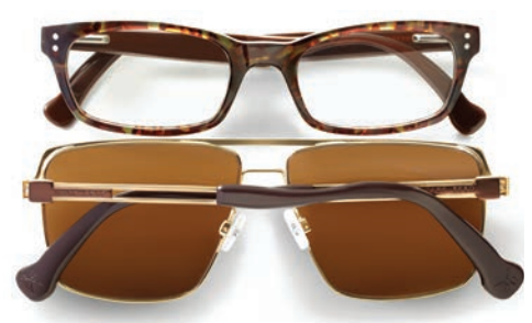
Marc Ecko Cut & Sew Monitor, Mile High

A new American sensibility that re-imagines cult classics, Marc Ecko Cut & Sew eyewear is an expression of artistic creativity for men ages 20-40 who know that authenticity counts. XLFit™ selections available.