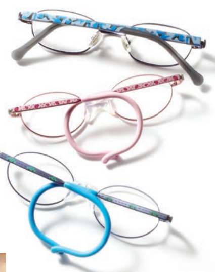
Dilli Dalli Munchkin, HotShot

IntelliFlex™ multi- action spring hinge.