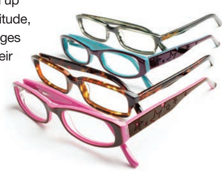
Digit Thermal, Magnetic

Hip, trendy, "grown up" looks with a fun attitude, for kids & tweens ages 6-12 who define their own individual sense of style.