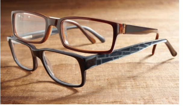
Junction City Fairmount, Forest Park

Inspired by cultural nuances of life in the city, the Junction City collection is all about today's fashionable styles at just the right price, for men and women ages 24-40.