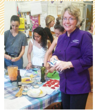
Mediterranean Diet cooking workshop