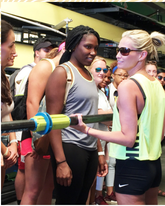
CEAR facility tour