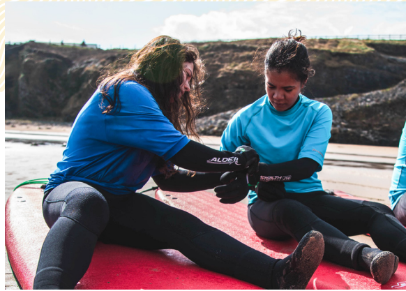
Surf lessons in Bundoran