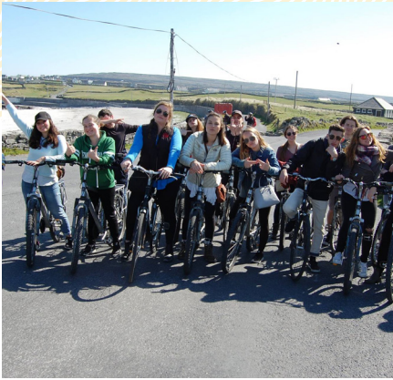
Riding bikes in Galway