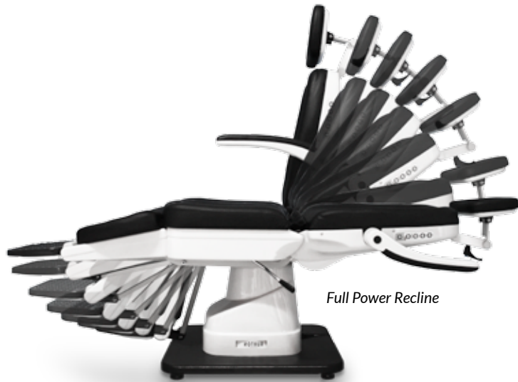
Full Power Recline