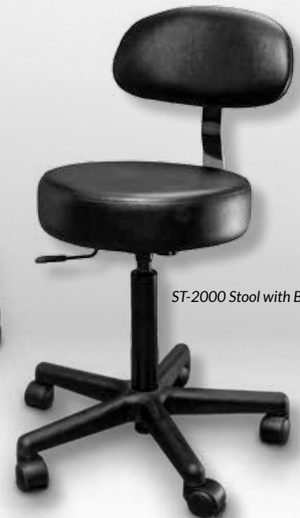
ST-2000 Stool with Back