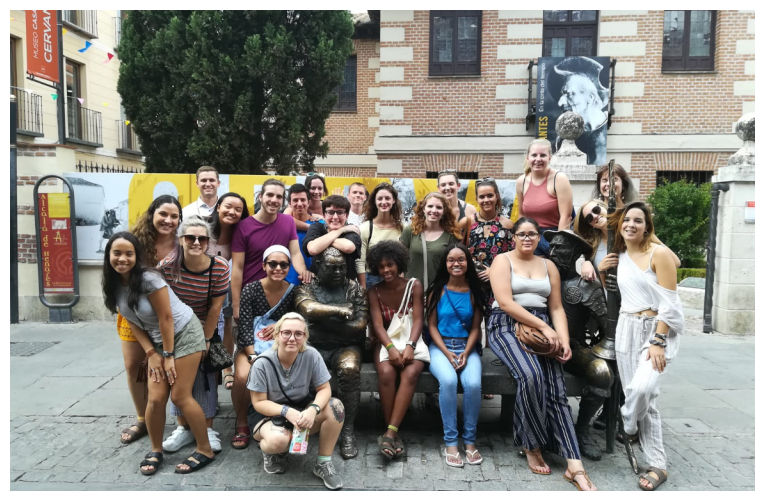
Students visiting the home of Miguel de Cervantes in Alcalá de Henares

Many courses include off-site activities and excursions related to the course. For our business courses, students visit small businesses and corporations in the area. Students in gastronomy will visit restaurants and take some cooking classes. In our tourism course, students will have an experiential component where they will have a practicum in a tourist agency.