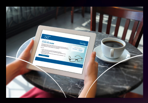
Vision is comprimised with Traditional PAL Lenses

This in effect, will result in less periphery distortion, wider viewing channels and uninterrupted vision without the needless unwanted astigmatism and distortion that is created by traditional surfacing methods.