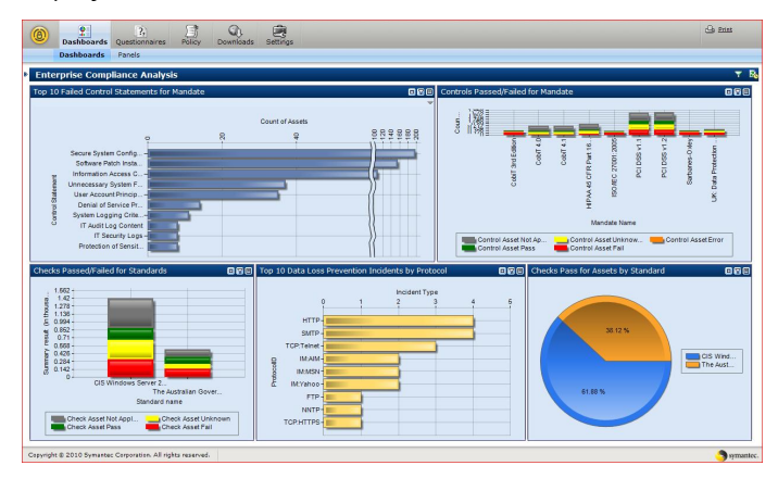
Figure 1: Top 10 Failed Controls Statements for Mandate

These highly customizable dashboards allow users to select from multiple panel views and filtering options, build actionable reports, and drill down to granular data to discover root causes and isolate problem areas. For example, you can deliver reports that show the percentage of systems in compliance with security standards for each business unit while allowing users to see exactly which servers met or failed to meet standards. Dashboards combine data gathered from all assets, data sets, controls and policies in one location to facilitate comprehensive analysis of your IT risk and compliance posture. And since there is no additional software required—these browser-based dashboards ensure low-cost, low-risk end-user deployment.