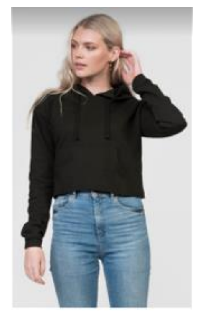
Girlie Cropped Hoodie