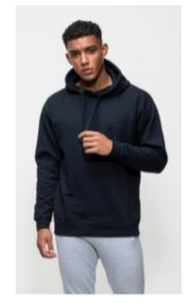
Epic Print Hoodie