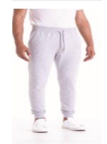
Tapered Track Pant