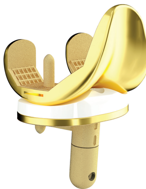
Gemini Primary Knee