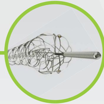
EMBOTRAP® II revascularization device